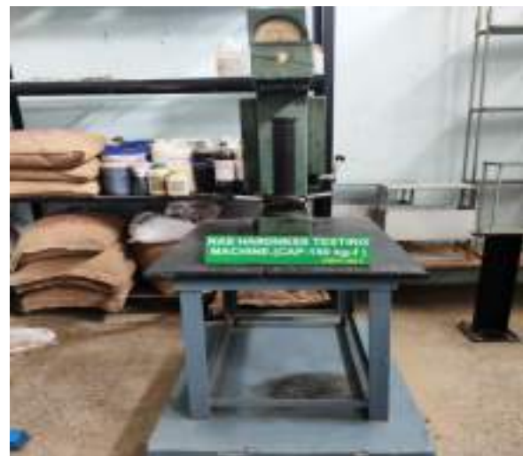
Ras Hardness Testing Machine

Application- Static bending test, Shear test parallel to grain.