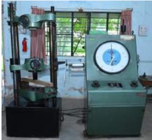
Universal Testing Machine (Analogue) Manufacturer -Fuel Instruments & Engineers Pvt. Ltd. (FIE) . Capacity - 400KN Application -Tension Test, Compression Test, Bending Test, Shear Test.