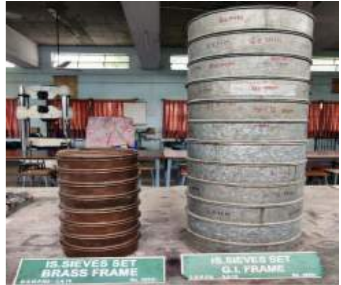
IS Sieves Brass and G.I

Application- To to know the toughness of aggregate