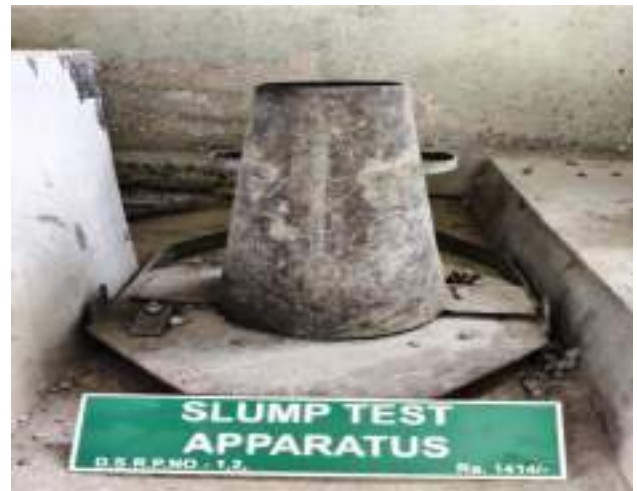
Slump Cone Test Apparatus

Application- To determine workability of concrete