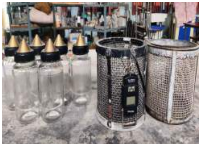
Pycnometer and Density bucket

Application- Fineness modulus and grading of aggregate.