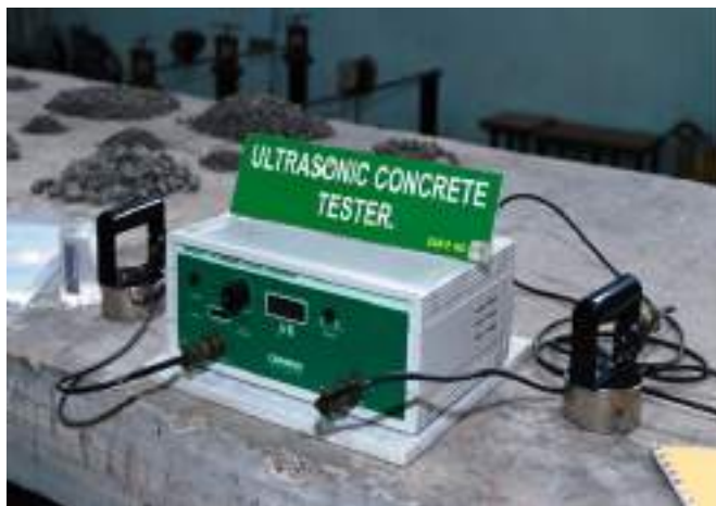
Concrete Ultrasonic Testing Equipment

Manufacturer- Fuel Instruments &Engineers Pvt.Ltd. Application- To determine the behaviour of metals especially steel and steel castings under Impact stresses