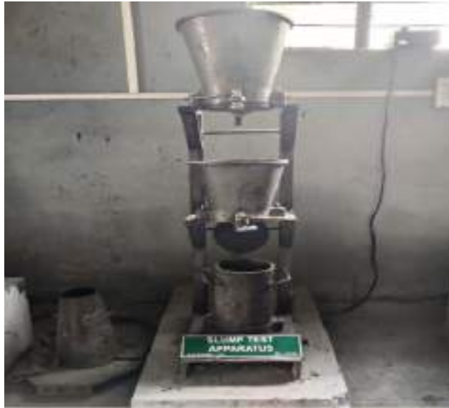
Compaction Factor Apparatus