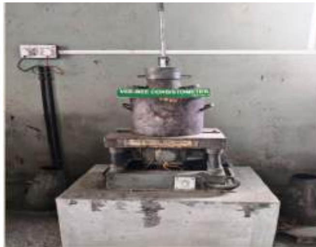
Vee Bee Consistometer

Application- To determine workability of concrete.