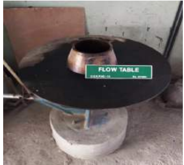
Flow Table Test Apparatus

Application- To determine workability of concrete