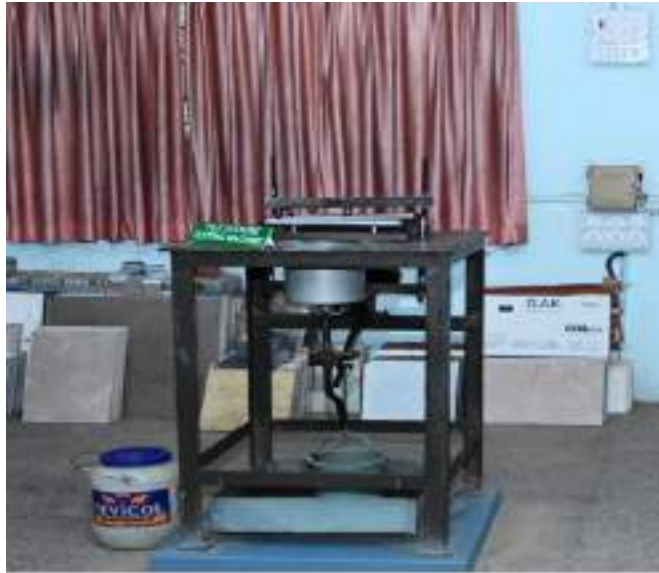
Tile Flexure Strength Testing Machine

Manufacturer- Associated Instrument Manufactures Pvt.Ltd. Capacity- 200kg Application- To check the flexure strength of cement concrete flooring tiles, clay roofing tiles (Mangalore pattern).