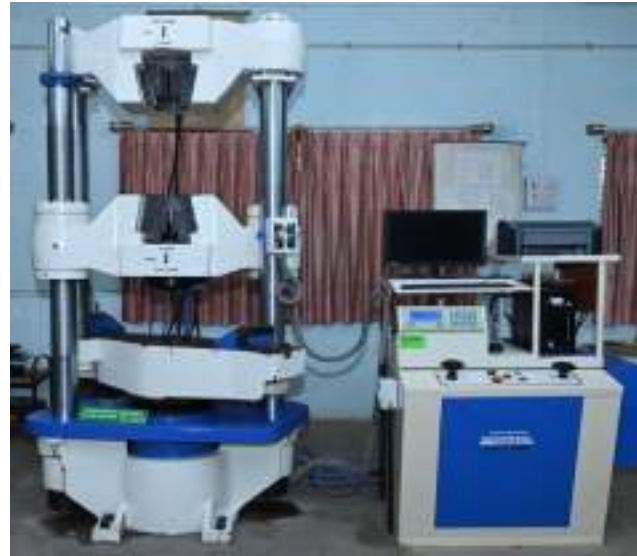
Universal Testing Machine (UTM)- computerized Manufacturer - Fine Spavy Associates & Engineers Pvt. Ltd. Capacity - 1000KN Application - Tension Test, Compression Test, Bending Test, Shear Test, Bend Re-bend Test