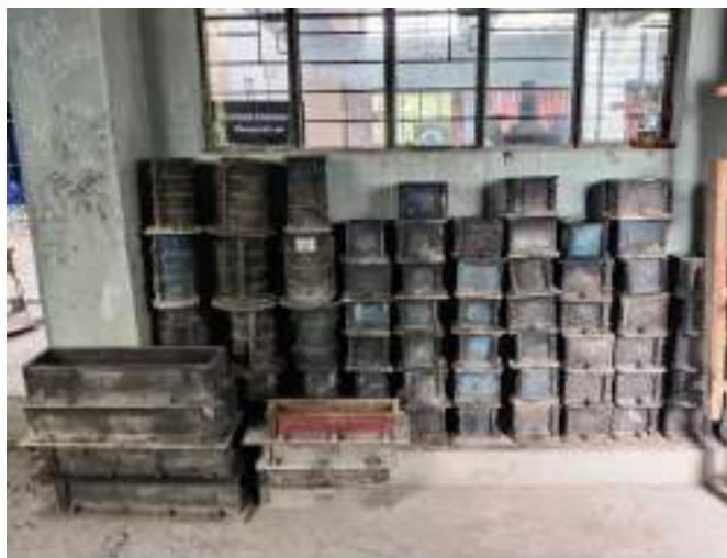
Concrete Moulds (Cube and Beam molds)