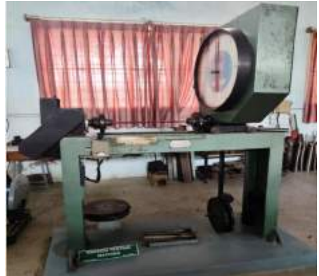
Torsion Testing Machine

Application- Tensometer can be used to test a variety of materials such as metals, plastic, timber, ceramics, cement, fabrics, etc. in tension, shear, compression and bend.