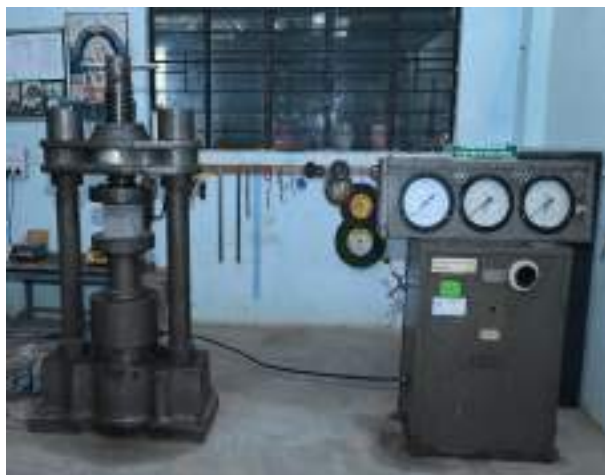
Compression Testing Machine Manufacturer -Associated Instrument Manufacturers (INDIA) Pvt. Ltd. Capacity - 2000KN Application - Compression Test