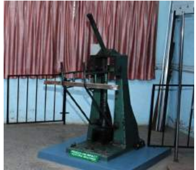
Impact Testing Machine( Charpy and Izod Test)

Manufacturer- Associated Instrument Manufactures Pvt.Ltd. Capacity- 200kg Application- To check the flexure strength of cement concrete flooring tiles, clay roofing tiles (Mangalore pattern).