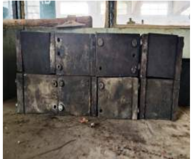
Cement Mold Size 70.6mmx70.6mmx70.6mm

Application- To find standard consistency, Initial and final setting time of cement.