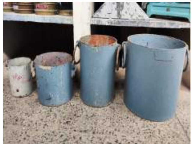
cylindrical containers (3, 15 & 30 litres)

Application- Specific gravity of aggregate