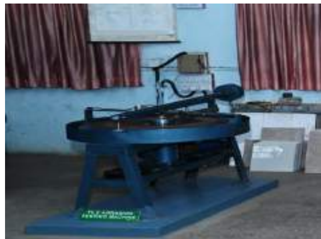
Tile Abrasion Testing Machine Manufacturer - Hydraulic & Engineering Instruments (HEICO) Application - To check Wear and Tear of cement concrete Flooring tiles.