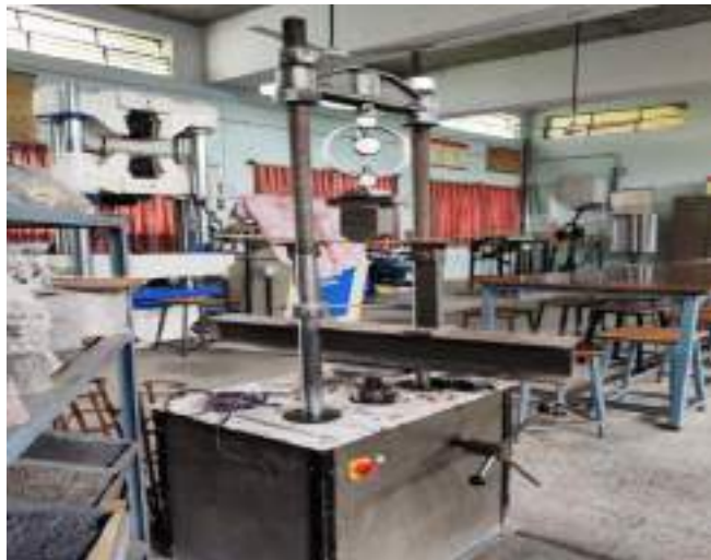
Universal Wood Testing Machine

Application- conducting torsion and twist on various metal wires, tubes, sheet materials