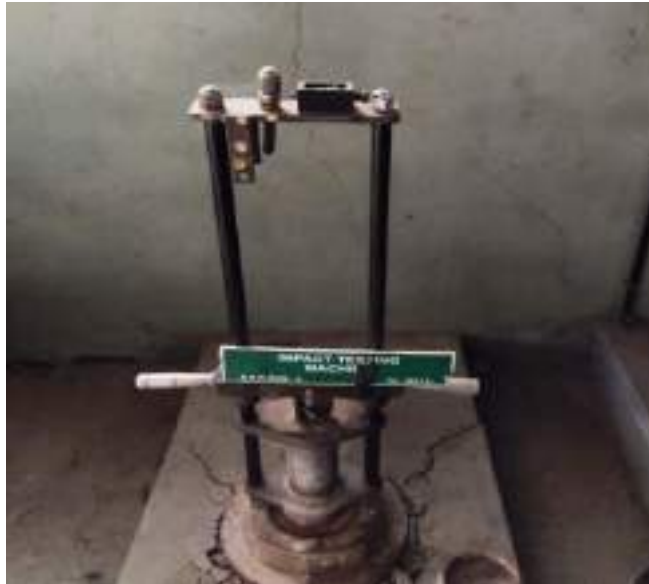
Aggregate Impact Testing Apparatus