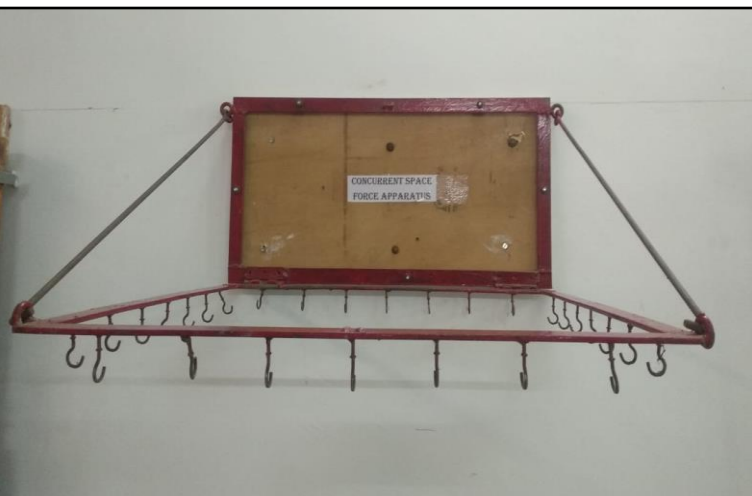
Space force assembly