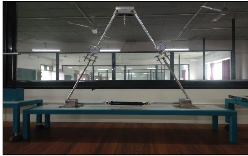
Analysis of truss assembly