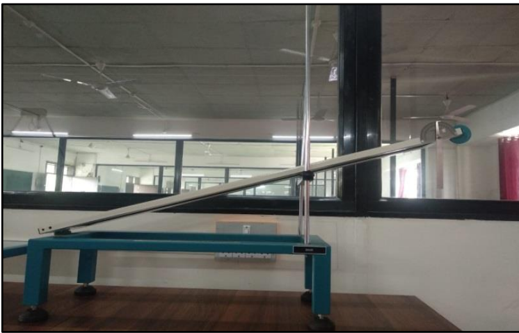
Coefficient of friction apparatus