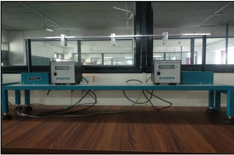
Reaction of beam apparatus